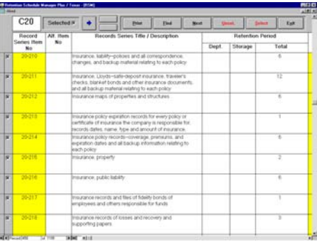
Retention Main Browsing Screen