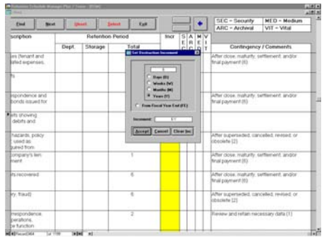
Entering Parameter for Automatic Calculation of Disposal Date